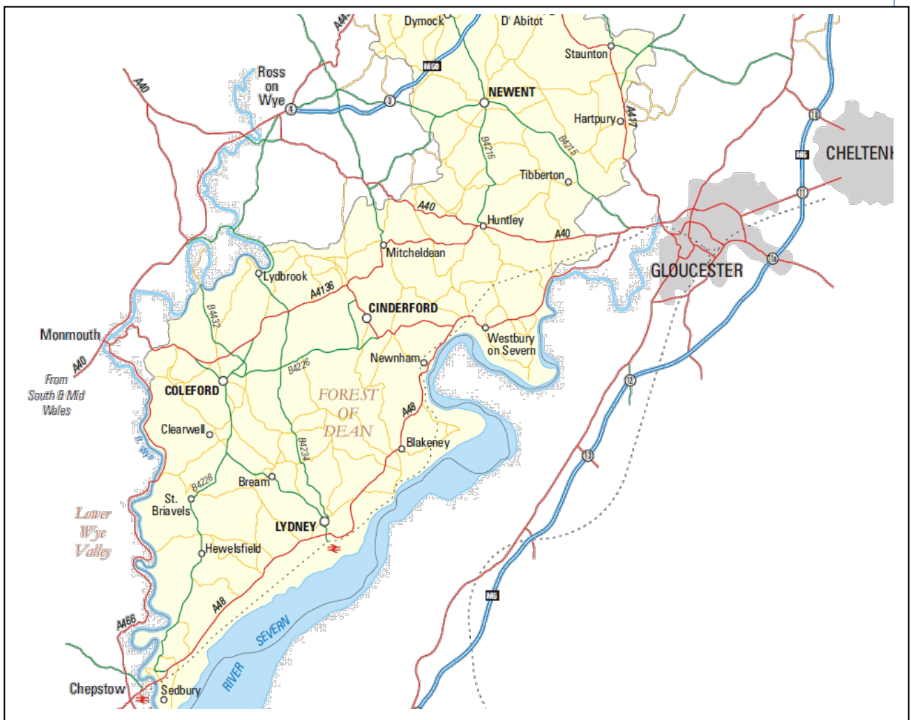
Figure 1: Location of Forest of Dean