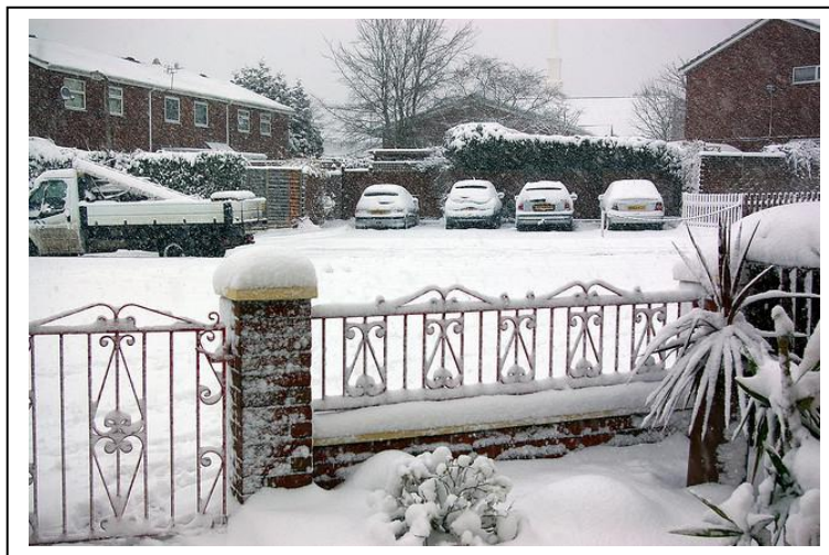
Broadwell, near Coleford, 2009

Some very minor roads were not accessible without vehicles tailored to the conditions (e.g. 4x4s or vehicles fitted with snow chains) for more than a week, sometimes isolating the hamlets or households on those routes.